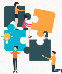
Team Building Skills