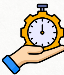
Time Management Skills